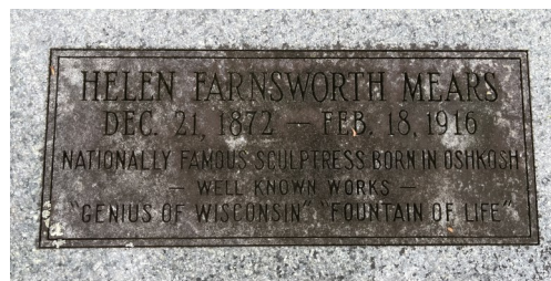
Prior to restoration.