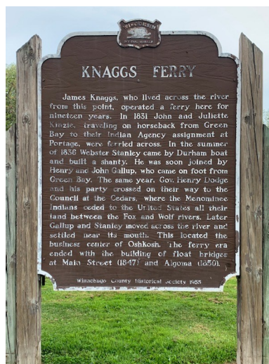
Prior to restoration.