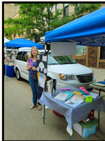
WGS at Summer Farmers Market

Name: _____ Street Address: _____ City: _____ State: _____ Zip: _____ Phone Number: _____ Email: _____