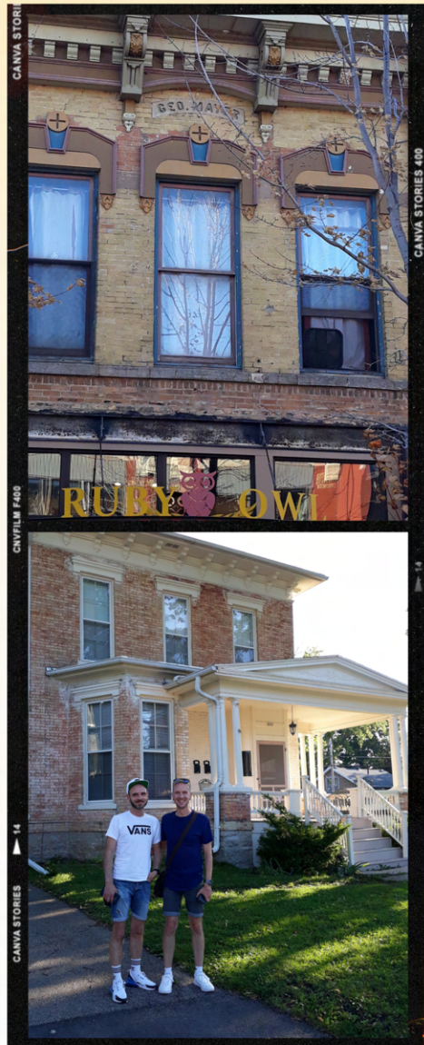
Top: Mayer Bldg 421 Main St.

The research that I have done on the Morgan House, the Grand Opera House, the Athearn Hotel etc., has already made me familiar with so many names from the past. It's a real treat for me to meet and give tours to present day relatives in search of past ancestors.